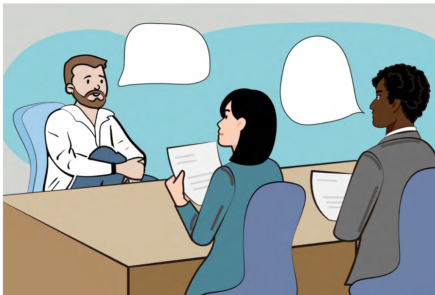
Joint interview and a collaborative investigation