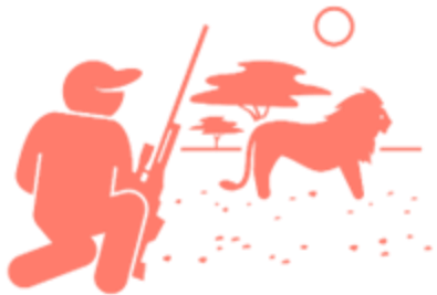
Poaching & Theft