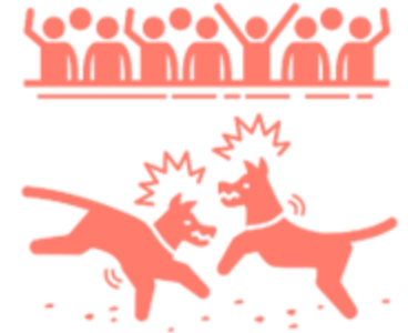
Animal cruelty & abuse