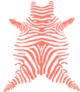
Illicit wildlife use