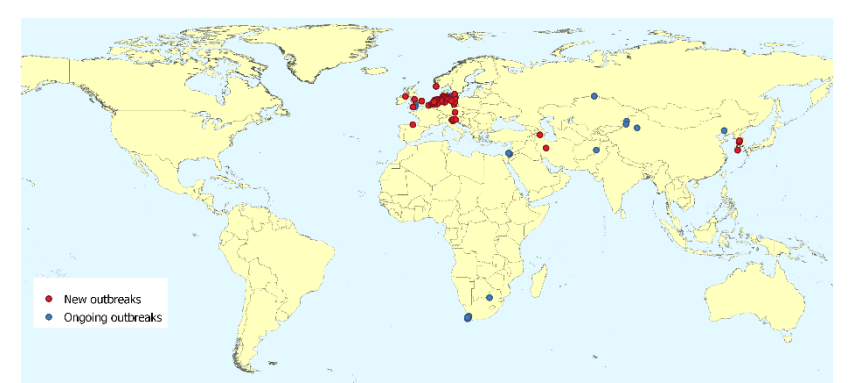
Figure 2. New and ongoing outbreaks in non-poultry, including wild birds (13 November - 04 December, 2020)

In this period, 193 new outbreaks were notified in non-poultry in 11 countries in Asia and Europe. The total ongoing HPAI outbreaks (blue dots on the map) in these bird populations is 310. They are distributed as follows: Africa (9), Asia (27), and Europe (274).